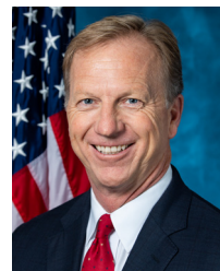
U.S. Representative Kevin Hern