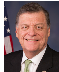
U.S. Representative Tom Cole