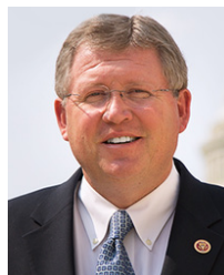
U.S. Representative Frank Lucas