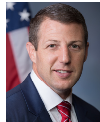
U.S. Representative Markwayne Mullin