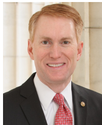
U.S. Senator James Lankford