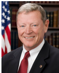
U.S. Senator Jim Inhofe