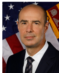
Eugene Scalia U.S. Secretary of Labor