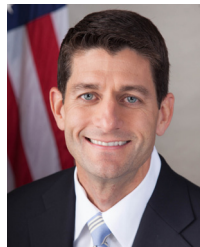
Former U.S. Speaker of the House Paul Ryan